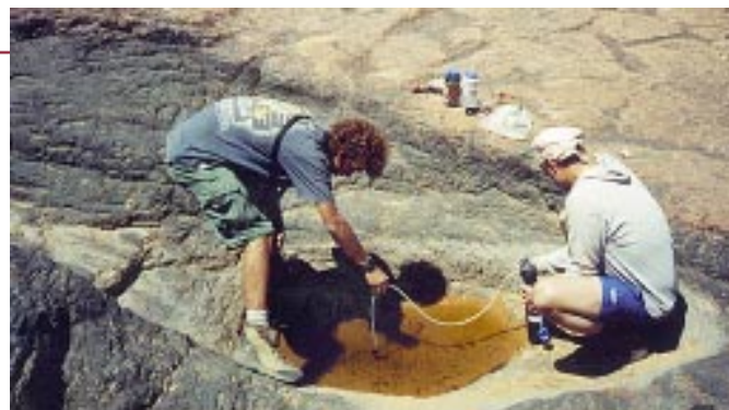
Tadpole Pumping, South Bass ^ • Thunder River Chimney Climb >

Ut wisi enim ad minim veniam, quis nostrud exerci tation ullamcorper suscipit lobortis nisl ut aliquip ex ea commodo consequat. Duis autem vel eum iriure dolor in hendrerit in vulputate velit esse molestie consequat, vel illum dolore eu feugiat nulla facilisis at vero eros et accumsan et iusto odio dignissim qui blandit praesent luptatum zzril delenit augue duis dolore te feugait nulla facilisi. Lorem ipsum dolor sit amet, consectetur adipiscing elit, sed diam nonummy nibh euismod