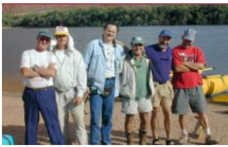
Happy Campers, May 2000, Lees Ferry From L - R lamcorper, suscipit lobortis, nisl ut aliquip .ex ea commodo consequat, duis autem vel eum, iriure dolor in hendrerit in